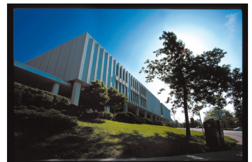
Duncan McArthur Hall, Faculty of Education Queen's University

The Chair intends to host a minimum of two national and/or international conferences or symposia at Queen University during each academic year.