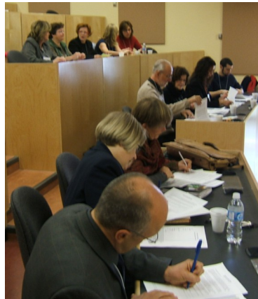
Web-cast participants in the Akwe:kon Room

techniques to broadcast your ideas. Well done." A viewer who made extensive use of the discussion board remarked, "It was great to be able to participate online in this kind of forum."