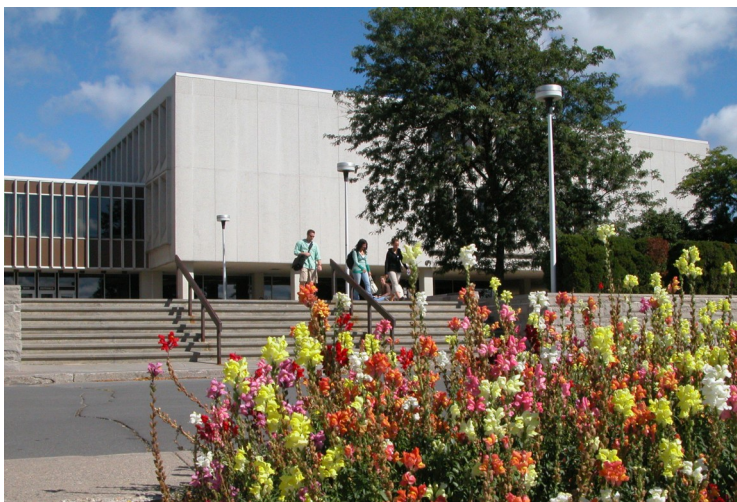
Duncan McArthur Hall, home of the Faculty of Education at Queen's University.

Further information will be posted on a separate PS2009 website which is yet to be constructed. The address will be published in future editions of this newsletter.